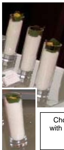
Chocolate cornets with mango sabayon