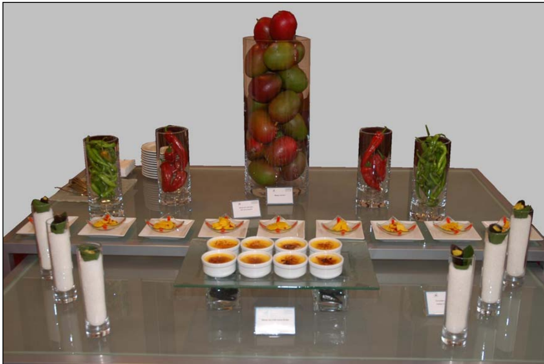
Mango and chilli salad with citrus segments, chocolate cornet with mango sabayon and chilli crème brûlée.